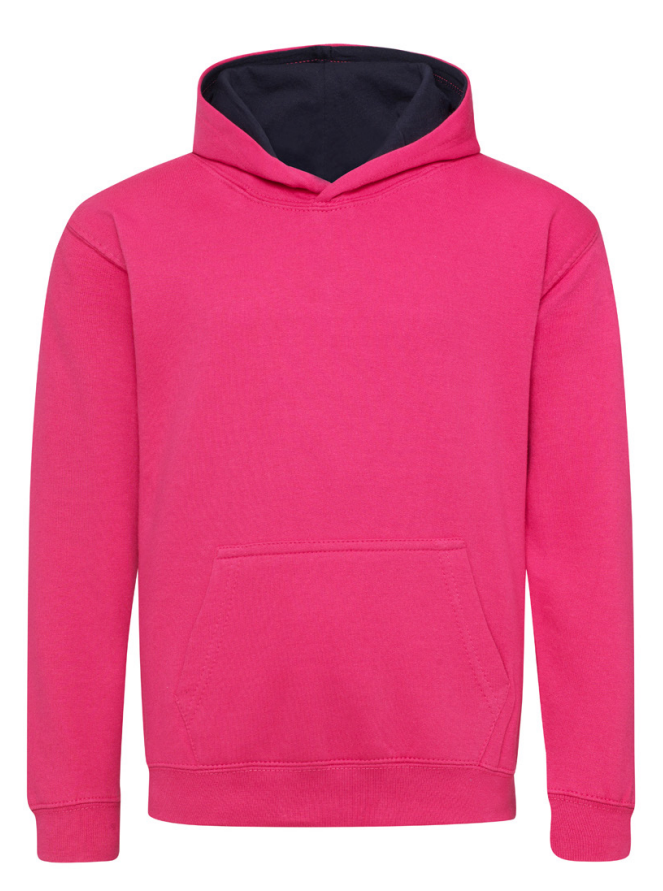
Hot Pink/French Navy